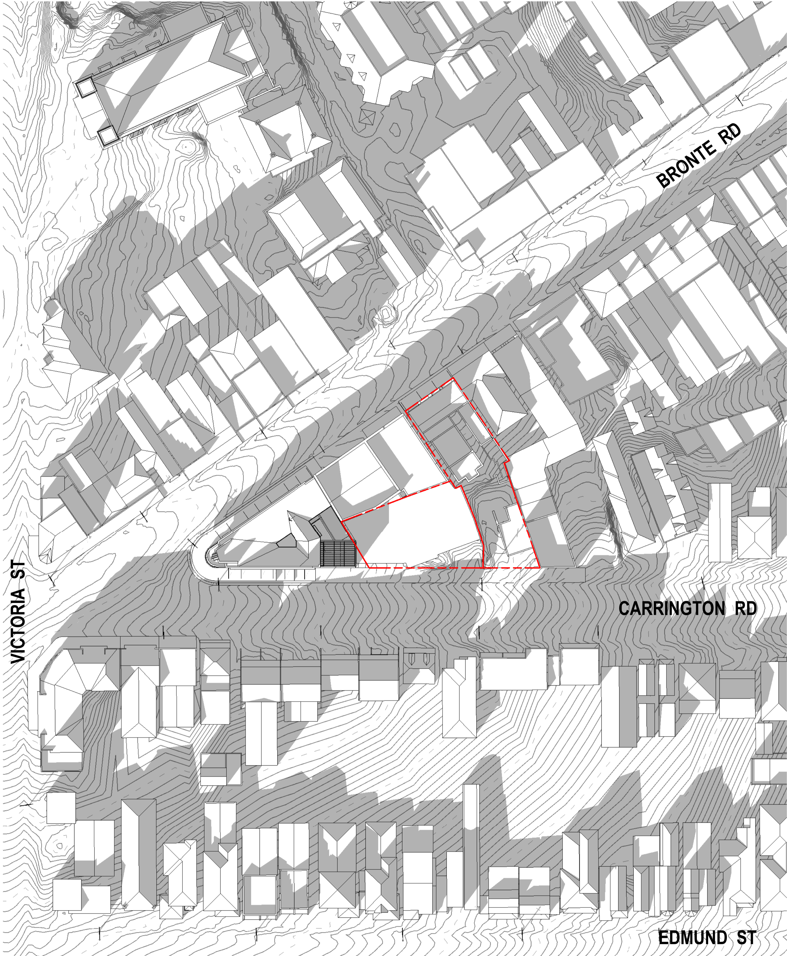
1 Shadow Plan - Existing - Winter Solstice 3:00PM 1 : 500